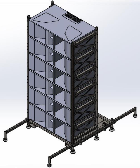
MP-150 Transport Cart:

Patents Issued & Pending, see: https://msi-dfat.com/patents